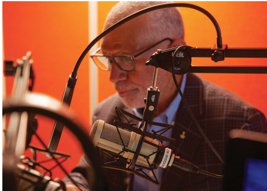
Charles F. Bolden Jr.

With this project, gifts to the Friends and Foundation enhanced Richland Library’s resources to create connections and build community through shared history.